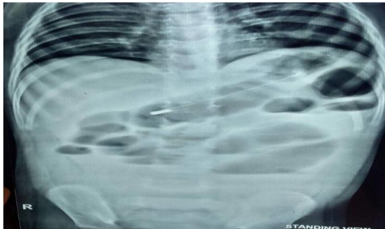
Figure 1: X-ray abdomen erect showing multiple air fluid levels.

Although Meckel's diverticulum is usually asymptomatic, it may present with abdominal pain in many ways. The three most common presentations are bleeding, obstruction and inflammation. [Table 1] The tip of Meckel's diverticulum may still be connected to umbilicus by a fibrous band over which the bowel may rotate or which may compress the bowel leading to closed loop small bowel obstruction. It may also become inflamed secondary to presence of gastric type of epithelium.