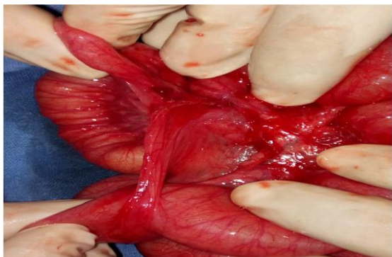
Figure 2: Clinical picture showing dense adhesion around the diverticulum.

Inflammation leads to formation of adhesions with the adjacent bowel segments, the active gastric mucosa may cause ulceration and intraluminal bleeding causing dark-red stools or extra luminal bleeding causing peritonitis. In such cases the child looks pale secondary to anaemia. In such cases it masquerades as acute appendicitis.