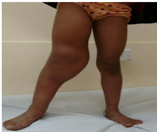
Figure 1: Clinical Photo (1).

femoral reflux or any stenosis. Histological examination showed proliferation of adipose tissue. The patient was explained about the procedures involving soft tissue and bony correction. But patient was lost in follow up, most probably due to his bad financial status.