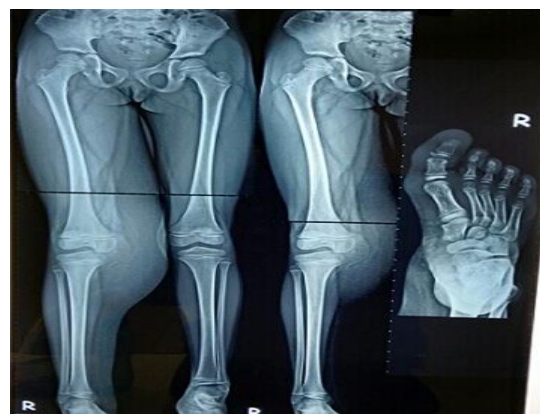
Figure 4: Scannogram of lower limb with X-ray right foot AP view.