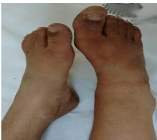
Figure 3: Clinical Photo (3).