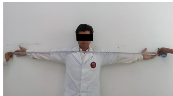
Figure 1: Procedure of measuring the arm span.

Statistical Analysis- Mean and standard deviations were obtained for both anthropometric variables. The relationships between body height and arm span were determined using simple correlation coefficients. Then a linear regression analysis was evaluated to examine the extent to which arm span can reliably predict body height. Finally, these relationships were plotted as scatter diagram. Statistical significance was set at p < 0.05 .