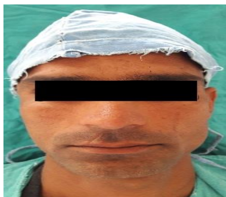
Figure 1: Frontal view.

On local examination, there was depression on the right side in the zygomatic region and reduced mouth opening of 20 cm. On palpation, confirmation of the depression and tenderness on the zygomatic arch area was appreciated. Submentovertex radiograph and computed tomography were advised. Fracture of the zygomatic arch was confirmed [Figure 2 and 3]. Arch elevation was decided as the treatment modality. After all the preliminary blood investigation and anesthetic evaluation, the case was posted under local anesthesia.