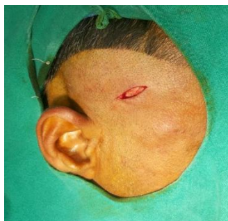
Figure 5: Modified temporal Incision Placed.

Under aseptic conditions, the superficial temporal artery was identified and marked. A modified temporal incision below the anterior branch of superficial temporal artery and 2 cm above the zygomatic arch was made.