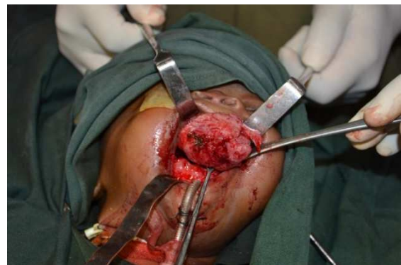
Figure 4a: Excellent access and visibility of the lesion.

The entire lesion was de-gloved from the adjacent tissues delineating from any vital tissues and was excised in toto [Figure 4b]. A fiber-optic endoscope was used to visualize the presence of any remnants [Figure 4c]. After thorough debridement and irrigation, haemostasis was achieved and then the osteotomised maxilla was reduced and secured into position [Figure 4d].