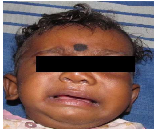
Figure 1a: Pre-operative pictures showing the extra oral presentation of lesion.

A five-month-old male infant was brought to our unit by his parents with a complaint of a slowly expanding, swelling of left maxilla that had started approximately two months earlier. The swelling considerably increased in size and extent over the span of one month [Figure 1a, 1b]. They also complained of nasal discharge and lachrymation on the left side. The child was irritable and was not feeding well. An extra-oral examination, there was an obvious swelling on the left side of the cheek and evident proptosis of the left eye. Vision and eye movements were tested to be satisfactory. Intra-oral examination revealed no obvious representation.