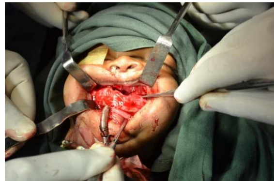
Figure 4: Le fort 1 access osteotomy and Maxillary down fracture.

An intra-oral maxillary vestibular incision was made extending from the midline to the first molar region bilaterally. The underlying bone was exposed after sub-periosteal dissection and raising a full thickness flap. Le Fort I cuts were performed with rotary burs under copious irrigation extending bilaterally from the pyriform fossa to the pterygoid region followed by down fracture of the maxilla [Figure 4]. This provided excellent visibility and access to the entire lesion [Figure 4a].