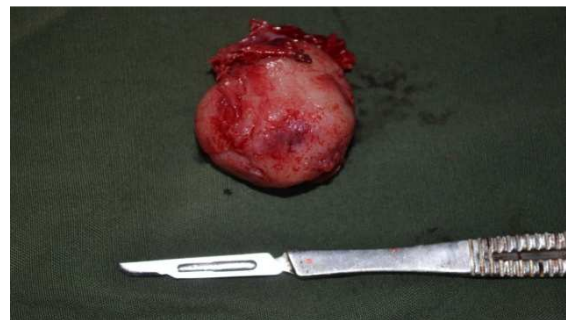
Figure 4b: Excellent access and visibility of the lesion.

The entire lesion was de-gloved from the adjacent tissues delineating from any vital tissues and was excised in toto [Figure 4b]. A fiber-optic endoscope was used to visualize the presence of any remnants [Figure 4c]. After thorough debridement and irrigation, haemostasis was achieved and then the osteotomised maxilla was reduced and secured into position [Figure 4d].