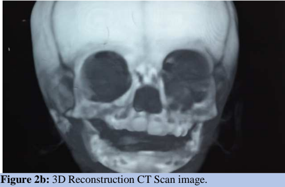
Figure 2b: 3D Reconstruction CT Scan image.