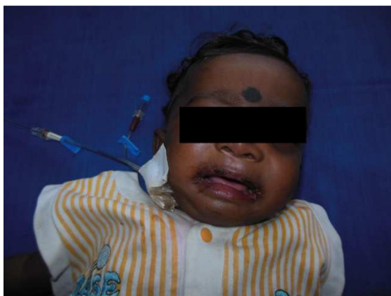
Figure 5: Immediate post operative cosmesis.

The patient was followed up at regular intervals for a period of six months after discharge.