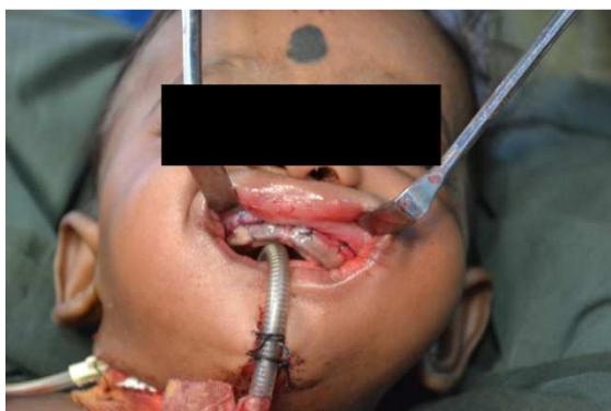
Figure 4d: Maxilla reduced and secured in position.

The incision was closed with resorbable sutures and intraoral pack was placed. Postoperative cosmesis was appreciable [Figure 5].