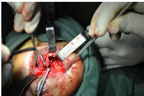
Figure 4c: Fibre optic endoscopic exploration to ensure complete excision.