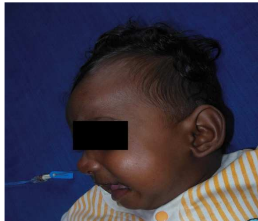
Figure 1b: Pre-operative pictures showing the extra oral presentation of lesion.