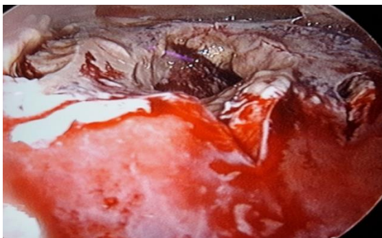
Showing Ruptured Liver Abscess

In this study, out of 60, 58 patients (96.67%) were males and 2 patients (3.33%) were females; male to female ratio was 29:1. Fever was the most common presenting symptom in this study present in 46 cases (76.67%). Tenderness at right upper quadrant was the most common clinical sign present in 33 (55%) cases. Out of 60 cases of liver abscess, history of alcoholism were present in 44 (73.33%) cases. Pus aspirated from all abscesses was sent for culture and sensitivity. It showed E.coli in 09 cases (15%), Klebsiella in 06 cases (10%), Enterococcus faecalis in 02 cases (3.33%) and no growth in 43 (71.67%) cases. Amoebic serology (IgM ELISA) done in all cases to confirm the diagnosis. In the present study out of total 60 patients studied, amoebic serology was positive for IgM antibodies with significant titres in 47 (78.33%) patients and absent in 13 (21.67%) patients. Ultrasound usually demonstrates a round or oval area that was less echogenic than the surrounding liver and can reliably distinguish solid from cystic lesions. In this study, 80% (48 patients) of the abscesses were located in right lobe of liver, 15% (09 patients) of the abscesses were located in left lobe of liver and rest 05% (03 patients) of the abscesses were located in both lobes of liver. Out of total 60 cases, 47 (78.34%) patients had amoebic liver abscess, 11 (18.33%) patients had pyogenic liver abscess and rest 2 (3.33%) patients had abscess of indeterminate etiology.