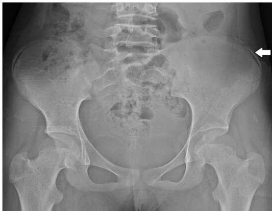
Figure 1: 17-Years female with Grade I ossification depicting 25% of iliac apophysis ossification on the lateral part (horizontal white arrow).

Grade IV in two children (9.5%) Grade V in six patients (28.5%) The ossification pattern was not tallying as per the standard data but rather as that of individual factors.