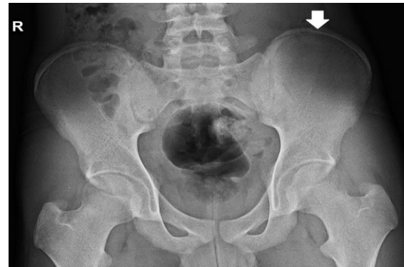
Figure 4: X-ray pelvis anteroposterior view of pelvis of 17 years old boy with Grade V where complete iliac apophyseal ossification and fusion with that of iliac crest (white arrow)

There was delayed skeletal maturity in case of females as compared to males in this region. The other factors which can be attributed are the dietary background. There is also some discrimination of females in Haryana state and the sex ratio is alarmingly declining.