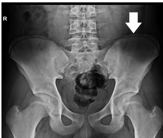
Figure 3: Xray pelvic anteroposterior view of 15 years old boy with Risser's sign Grade IV where iliac apophysis is extending from lateral to the medial side up to the spinal extent (vertical white arrow).