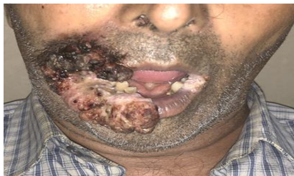
Figure 3: Patient presented with Ca Buccal mucosa.