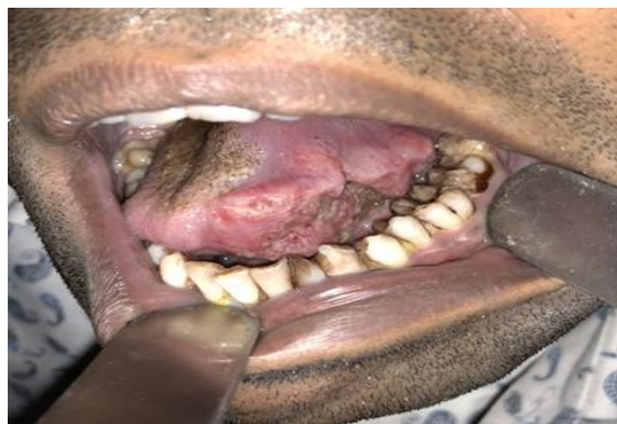
Figure 3: Patient presented with Ca tongue.