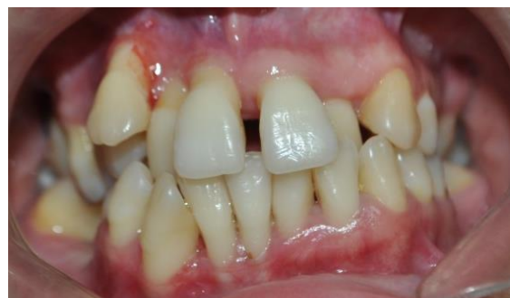
Figure 5: Regression of gingival inflammation after 2 months.

Two months later, the patient was re-evaluated and a regression of gingival inflammation was observed [Figure 5]. This reason allowed to refer the patient to orthodontic department for correction of dental malpositions, with periodic visits. Unfortunately, the patient declined the treatment for financial difficulties.