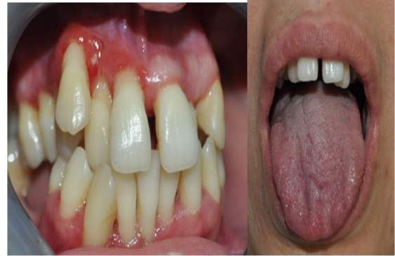
Figure 3: An intra-oral image showing severe gingival inflammation and asymetry of the tongue

It was observed also gingival recessions with attachment loss of 2 to 3 mm. It shows also dental malocclusions, and an unilateral atrophy of tongue [Figure 3]