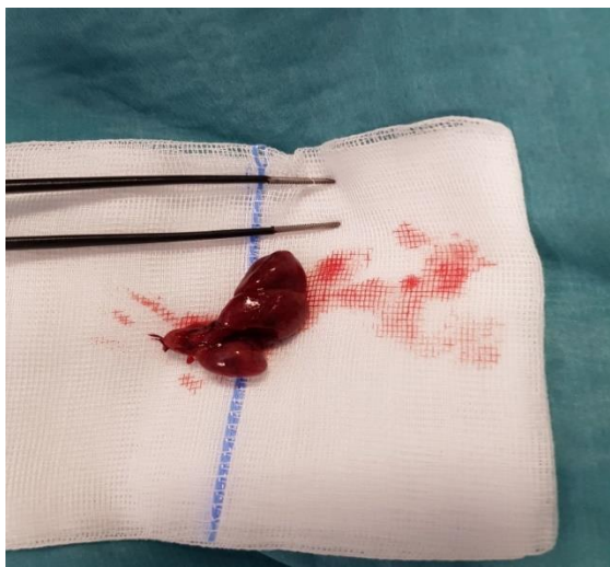
Figure 3: Parathyroid adenoma.

Effects of successful surgery materialized in stable endocrine equilibrium, control of hypercalcemic features through disappearance or at least enhancing of most clinical features and normalization of biological constants.