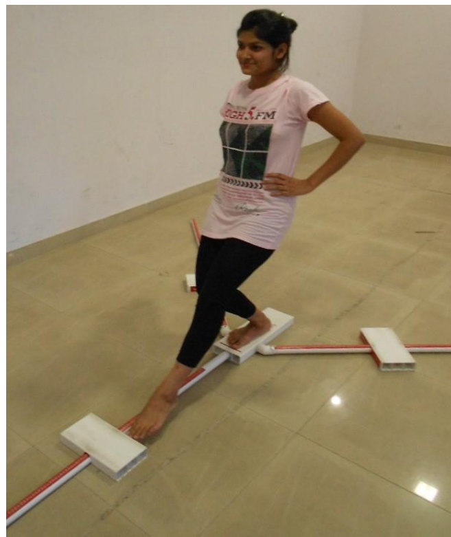
Figure 2: Test protocol, Figure shows the process of performing the Y balance test. The subject stands on the foot plate (grid) in the center with dominant leg, placing his most distal aspect of the great toe at the starting line. While sustaining this position, the subject is advised to reach as maximum as he can with the free limb in all the three directions. The measurement of the maximal reach distance is taken by tape measure at the edge of the reach indicator to assess dynamic balance.

ICC: intraclass correlation coefficient; CI: confidence interval; SEM: standard error of measurement; SDD: smallest detectable difference.