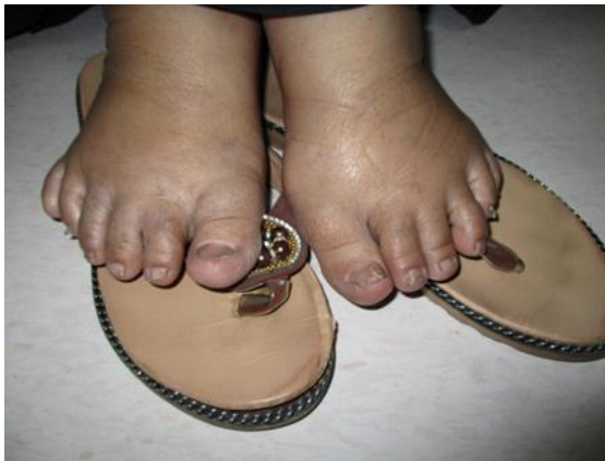
Figure 1: Both Foot show: lower limb polydactyly.

Fundus Exam: multiple bony spicules and attenuated vessels with pale optic disc Retinitis pigmentosa on fundoscopy Fig.4 thinned and atrophy of RBE [Figure 5]