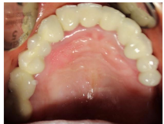
Figure 3: High arch palate and interdental papillae with a palatal swelling.