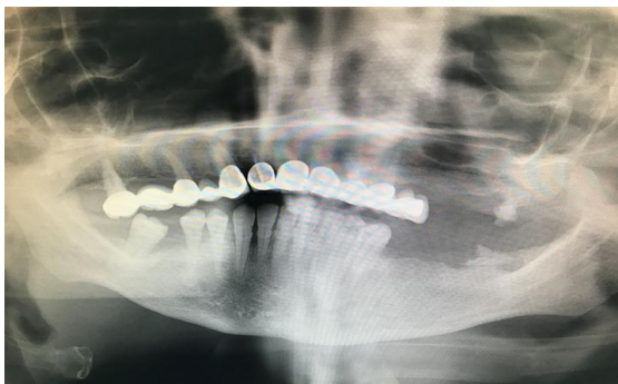
Figure 2: Orthopantomogram (OPG) dental X- Ray shown: Periodontitis and major bone loss.