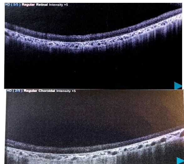
Figure 5: OCT of both right and Left shown: All retinal layer atrophy, thinned and absence of IS/OS junction in the foveal and extrafoveal region.