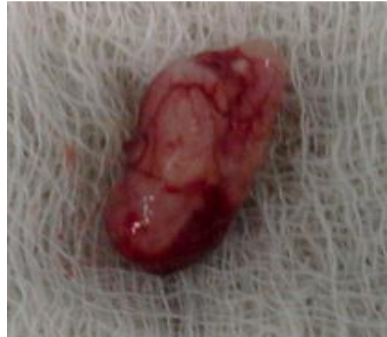
Figure 3: excised tumor.