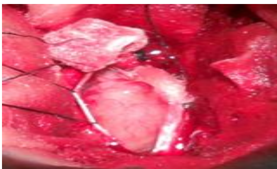
Figure 2: Laminectomy has been done dura opened and tumor dissected the tumor is bulging out in the dural opening.