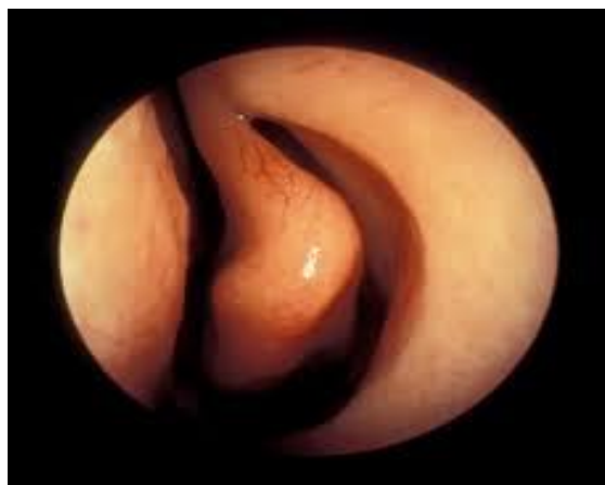
Figure 1: Endoscopic view of paradoxical middle turbinate

nasal septum in 41 % cases, infundibular obstruction was found in 67% cases, and discharge in middle meatus in 36 % cases.