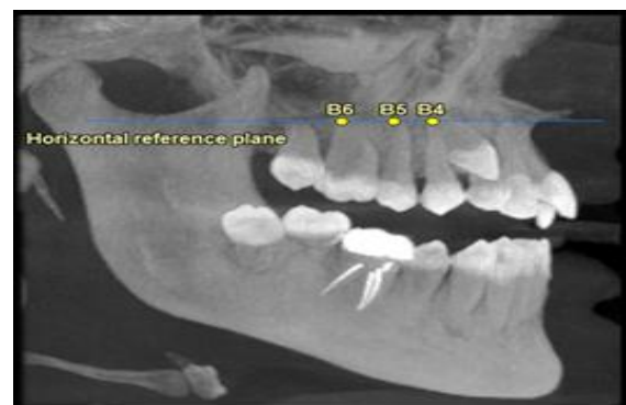
Figure 2: The right lateral view of the skull, illustrates points S4, S5, and S6 on the horizontal reference plane. Point B4 was marked directly above the midpoint of the maxillary first premolar. Point B5 was marked directly above the midpoint of the second premolar. Point B6 was marked directly above the midpoint of the first molar.