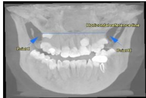
Figure 1: Reference points I and II on the frontal view of the skull, defined as the most superior aspect of the concavity of the maxillary bone as it joined the zygomatic process. A horizontal reference plane is drawn parallel to the floor through points I and II.

All CBCT images were oriented and standardized using the software provided by the manufacture. In the frontal and right lateral views, each image was oriented in three planes of space. In the frontal view, the head was positioned with the floor of the orbits parallel to the floor. In the right lateral view, the Frankfort horizontal line (upper rim of external auditory meatus, Porion, to the inferior border of the orbital rim, Orbitale) was adjusted so that it was parallel to the floor. After these steps were completed, the skull's position was saved and set as the default position throughout this study. All data were calculated from this new default position of the patient's three-dimensional skull. Evaluation of the parameters was based on the identification and registration of a series of points. First, points I and II were reference points that represented the level of basal bone of the maxilla. In the frontal view, these two landmarks were plotted on the right and left sides of the skull and were defined as the most superior aspect of the concavity of the maxillary bone as it joined the zygomatic process [Figure 1].