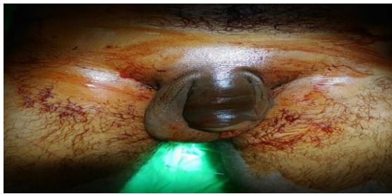
Figure 1: (Scrotal hematoma).