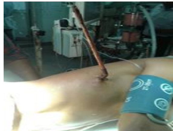
Figure 2: Arrow Injury.

One case was clinically unstable at presentation. Other cases were clinically stable. All cases had arrow in situ. Tetanus prophylaxis and antibiotics were routinely administered. All patients were explored and arrow removed carefully. Most of the patients recovered well. One patient was in shock and expired during course of treatment.