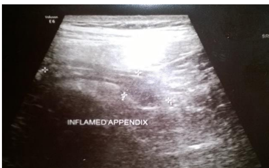
Figure 2: Ultrasonogram showing features suggestive of appendicitis.