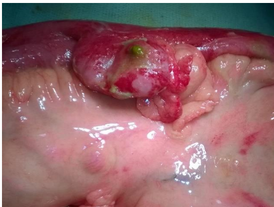
Figure 3: Inflamed and perforated Meckel's diverticulum.