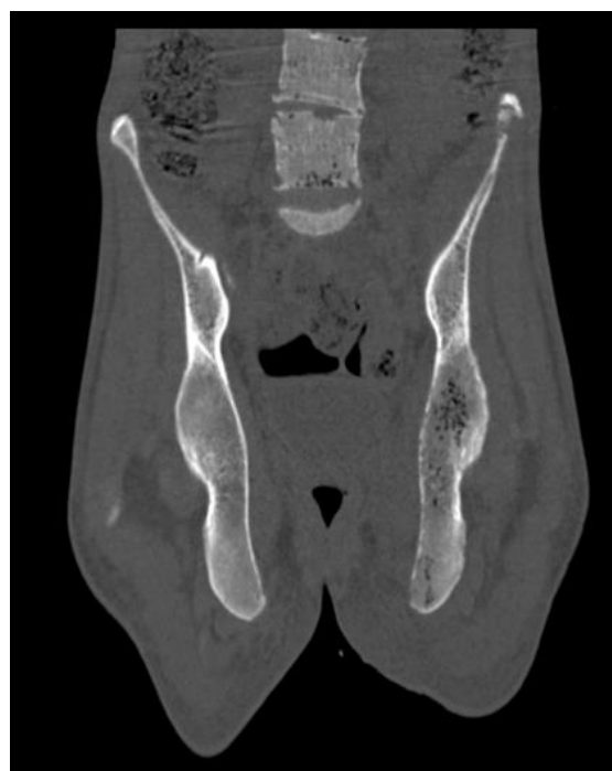
Figure 3: Intraosseous gas in vertebral bodies of L4 and L5 seen on computed tomography. Note uneven and bubbly appearance of gas within vertebral bodies.