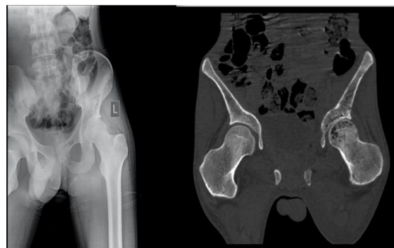
Figure 2: X ray showing lucent foci in left iliac bone and femoral head. Computed tomography confirmed presence of gas confirming the diagnosis of emphysematous osteomyelitis.

Computed tomography also revealed loculated fluid collections in the soft tissues medial to the proximal shaft of left femur with few foci of air and enhancement of walls on post contrast study suggestive of abscesses [Figure 4].