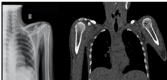
Figure 1: Left humeral head showing lucent foci. CT confirmed presence of intraosseous gas within humeral head.

In view of pain, tenderness and swelling of left thigh an initial plain X-Ray of left thigh was done which showed lucent foci in the left iliac bone. Similar lucent foci were also noted in the head of left humerus on left shoulder X-ray [Figure 1].