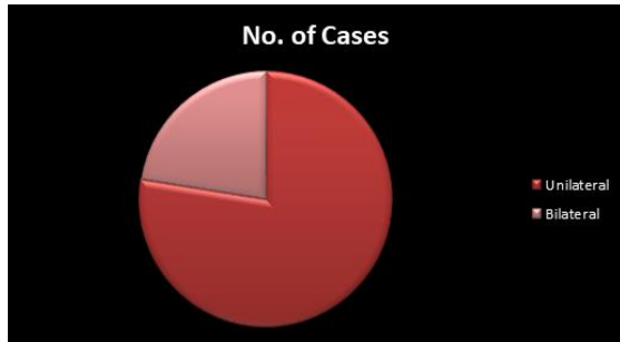
Figure 2: Laterality of nasal polyps and polypoidal lesions.

frequently noted in majority of patients (45 cases), of which 30 patients had mucopurulent discharge, while 15 patients had watery discharge. Epistaxis was also noted in 25 patients. Allergic symptoms like sneezing and rhinorrhea were noted in 15 cases. Nasal mass lesions were observed in 18 cases. Majority of polyps and polypoidal lesions presented with multiple symptoms [Table 2].