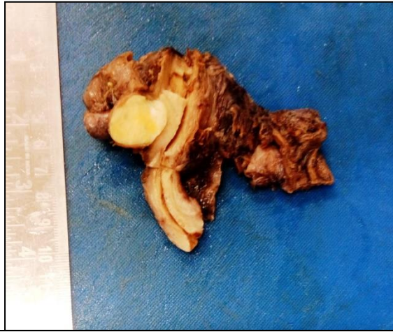
Figure 1: Cut section of the subserosal fibroid showing yellowish colour.

[Figure 2]. Intraoperative and postoperative period was uneventful and she was eventually discharged and advised for regular follow-up.