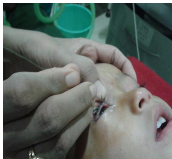
Figure 2: Showing Bowmans Probe Being Inserted Through Upper Canaliculi