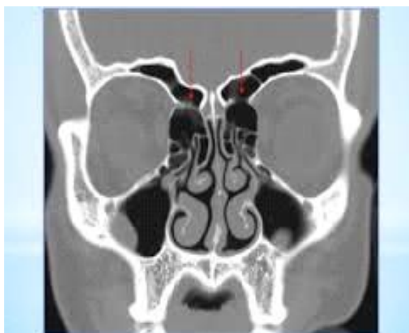
Figure 2: Supraorbital pneumatization.

Supraorbital pneumatization—This is the pneumatization of orbital roof by ethmoid air cells which lies posterolaterally to frontal recess. [Figure 2]