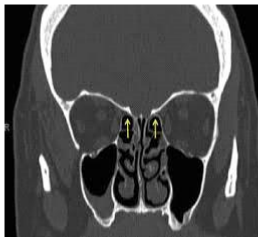
Figure 3: Presence of anterior ethmoidal artery canal.

Presence of anterior ethmoidal artery canal which can be seen fully or partially [Figure 3]