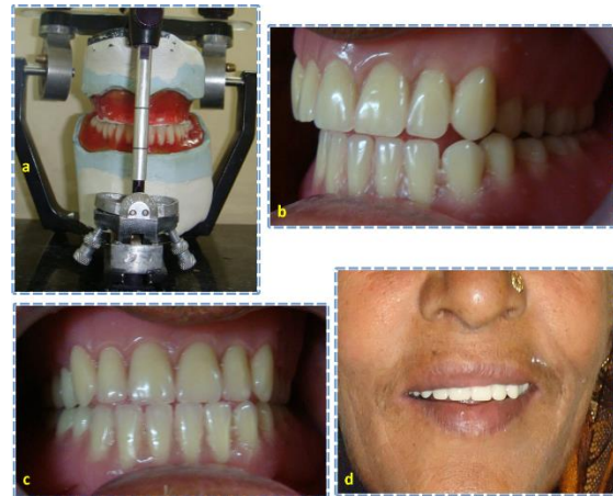
Figure 2: (a) Mandibular teeth arranged against functional maxillary record (b) Processed denture showing balancing contacts (c) Balancing contacts during protrusion (d) Finished complete denture prosthesis

After mandibular teeth were arranged, the maxillary teeth were then placed following their opposing fossa. Clinical and laboratory steps that followed were conventional. Balancing was corrected during laboratory remounting of denture processing [Figure 2b]. Complete denture was inserted and balancing was verified [Figure 2c]. Minor corrections were done using a clinical remount procedure. Instructions regarding denture care were given to the patient. The patient was satisfied with her complete denture prosthesis and reported no problems in occlusion over a period of three follow ups [Figure 2d].