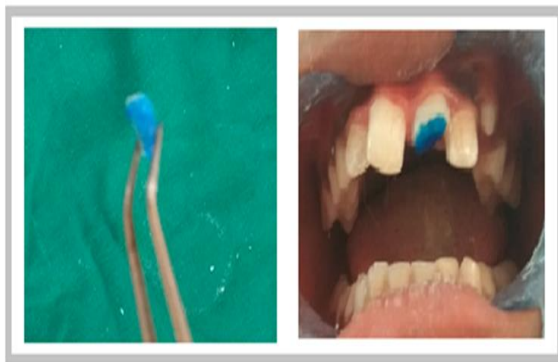
Figure 4: Etching two broken tooth fragments with 37% phosphoric acid.

After that, the canals were dried and filled with size F2 gutta-percha cones (Dentsply Ind. e Com. Ltda., Petrópolis, Brazil) and AH Plus sealer cement [Figure 5A]. Now, the pulp chamber was partially filled with restorative Glass Ionomer Cement. Then, the tooth fragment and the remaining tooth structure were prepared for bonding. An enamel bevel was prepared all around the remaining tooth structure as well as the fractured margin of the segment and the fragment was reapproximated to check its fit. An additional internal dentinal groove was also prepared within the dentine of the fractured fragment part. Acid etching of the access cavity and the approximating surfaces of the two segments were carried out for 20 s with 37% phosphoric acid.