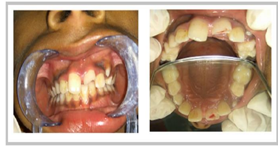
Figure 1: A: Preoperative clinical photograph, B: Complicated crown fracture involving enamel, dentin and exposing pulp.

# 15 (Dentsply/Maillefer, Ballaigues, Switzerland) based on the pre-operative radiographs [Figure 3].