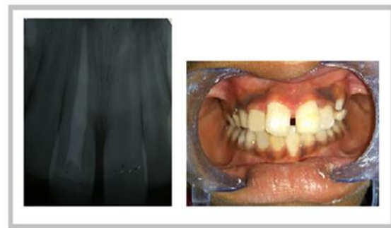
Figure 5: A: Post operative radiograph, B: Post operative clinical photograph.

With the advent of rotary endodontics, ProTaper files are commonly in use because when compared to other file systems, it has changing percentage tapers over the length of its cutting blades that serves to significantly improve flexibility, cutting efficiency, and safety. It's convex, triangular cross-section enhances the cutting action while decreasing the rotational friction between the blade of the file and dentin. The ProTaper Shaping files are allowed to be used like a brush, to laterally and selectively cut dentin on the outstroke and passively follow the glide path to optimize safety and efficiency. [12] Flexible files rotating in a curved canal require unimpeded space, and widening this space from the crown down seems the logical solution.