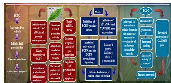
Figure 3: Anticancer effects of EGCG.

In addition, EGCG can also influence epidermal growth factor receptor-mediated signal transduction pathway. Over-expression of growth factor and growth factor receptors such as EGF receptor (EGFR), PDGF-Receptor (PDGFR) and others can result in a neoplastic phenotype in tumor cells. [3] It has been reported that EGCG enhances growth inhibitory effects of 5-fluorouracil by inhibiting YCU-N861 and YCU-H891 gene expression. Studies suggest that EGCG inhibits activation of EGFR and the EGFR downstream signaling by inhibiting EGFR tyrosine kinase. These mechanisms lead to enhanced inhibition of cancer cell proliferation [Figure 3]. [1]