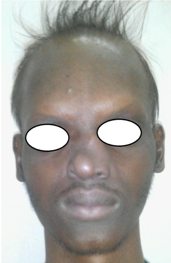
Figure 2: Facial view.

orthopantomograph revealed multiple impacted teeth in maxilla and mandible [Figure 4]. Family history revealed that this condition has been observed only in this individual since generations on both parents side.