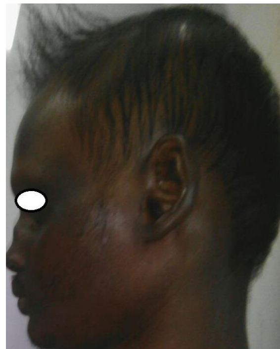
Figure 1: Left lateral view.

satisfactory. Hair distribution was sparse. Tolerant to heat was unsatisfactory. Skin, palms and soles were dry and parched. Protuberant lips, frontal bossing and depressed nasal bridge were also observed in extraoral examination. Vertical dimension of face was also reduced [Figure 1, Figure 2, Figure 3].