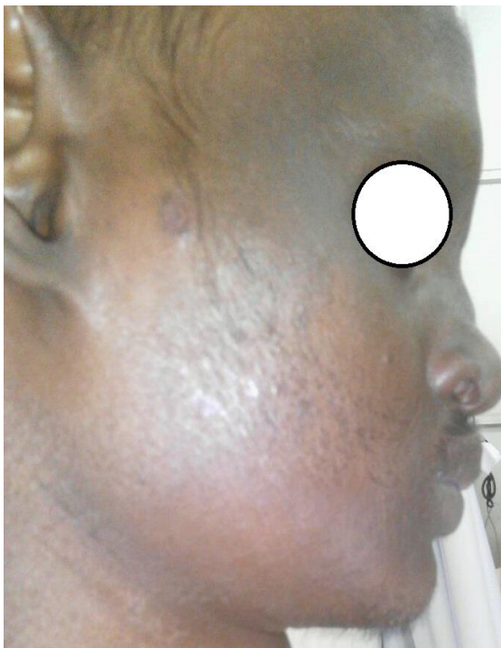
Figure 3: Right lateral view.