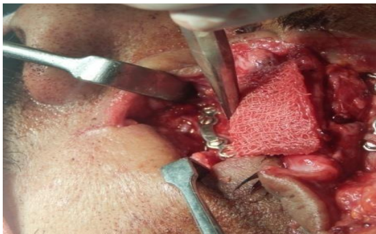
Figure 8: Shows infraorbital wall exposed and fixed with 2mm four hole orbital plate and 2*6 screws

The infraorbital wall was then exposed through laceration and the fracture segments identified and fixed with 2mm four hole orbital plate and 2*6 screws [Figure 8].