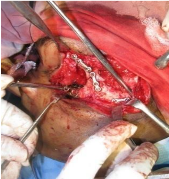
Figure 2: showing fracture fixation

Wound was debrided. Through the existing avulsive injury lateral orbital wall, zygomatic arch, infraorbital rim and floor of orbit was approachable. Fractures at all these sites were reduced and was fixed with 1.5mm stainless steel plates. The floor of orbit was comminuted, hence an orbital mesh was placed and fixed to the infraorbital rim. [Figure 2]