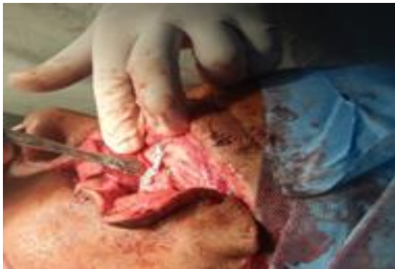
Figure 7: shows lateral orbital wall fixed with 2mm four hole orbital plate and 2*6 mm screws

Lateral orbital wall was fixed with 2mm four hole orbital plate and 2*6 mm screws [Figure 7].