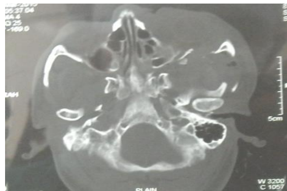
Figure 5: shows preoperative CT scan

Ophthalmology consultation was done and injury to globe and optic nerve also was ruled out. Inj.T.T 0.5 ml I/M stat and Inj.Tetglobe 250 IU I/M stat was administered. Routine antibiotics and analgesics were administered and the patient was transferred to emergency operation theatre. The wound was then debrided under general anaesthesia. Then the lateral orbital wall was exposed through the laceration and fracture segments identified [Figure 6].