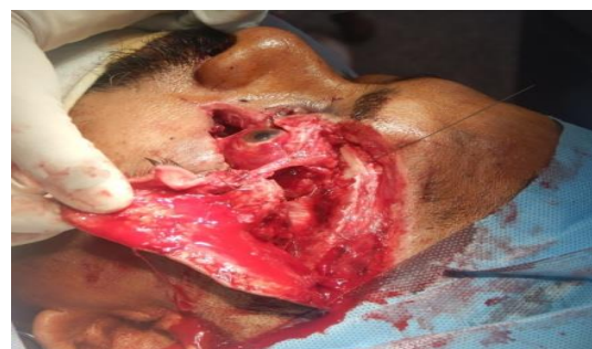
Figure 6: shows the exposed wound through the laceration and lateral orbital wall segments identified.

Ophthalmology consultation was done and injury to globe and optic nerve also was ruled out. Inj.T.T 0.5 ml I/M stat and Inj.Tetglobe 250 IU I/M stat was administered. Routine antibiotics and analgesics were administered and the patient was transferred to emergency operation theatre. The wound was then debrided under general anaesthesia. Then the lateral orbital wall was exposed through the laceration and fracture segments identified [Figure 6].