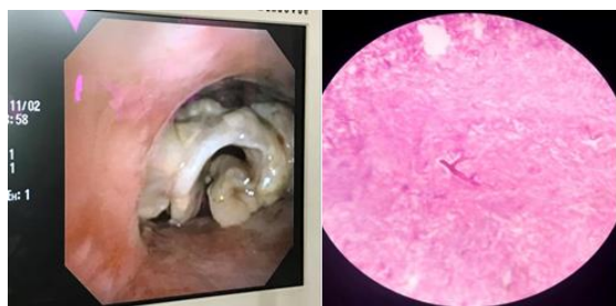
(1) Bronchoscopic view of hard mass like growth of mucor over carina obstructing main stem bronchus. (2) microscopic view showing filamentous aseptate branching fungal hyphae .

A 30 year old male patient was admitted in emergency of our hospital with complaints of shortness of breath & cough with expectoration for 1 month. He was known case of diabetes mellitus type-1 for 5 yrs. Sputum and blood cultures were sterile. In view of worsening breathlessness, patient was intubated. CT Chest revealed bilateral lower lobe pneumonia with large cavitating lesions in left upper lobe and left lower lobe. Bronchoscopy was performed which revealed dirty white hard mass like spiral growth over carina, obstructing the main stem bronchus. Biopsy revealed hyaline aseptate hyphae, with wide (right) angled, irregular branching pattern consistent with mucormycosis.