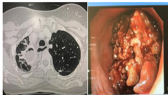
(1) CT chest showing right upper lobe cavity with mycetoma formation in it. (2) Bronchoscopic view of mycetoma within a cavity in right upper lobe.

Exploratory bronchoscopy was done. It revealed no evidence of active bleeding but there was a large mycetoma involving apico-posterior segment of right upper lobe. Bronchoscopic biopsy was taken. KOH mount and biopsy from fungal ball revealed hyaline branched septate fungal hyphae. Patient was managed conservatively with antifungal drugs and advised for bronchial artery embolization if there is recurrent/massive haemoptysis.