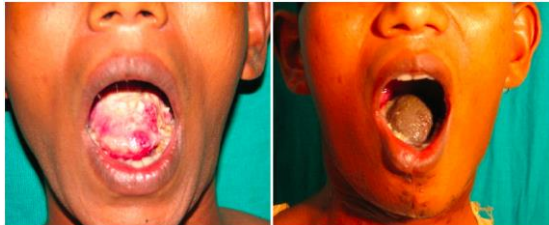
Figure 4: Tongue and floor of mouth reconstruction using Anterolateral thigh flap