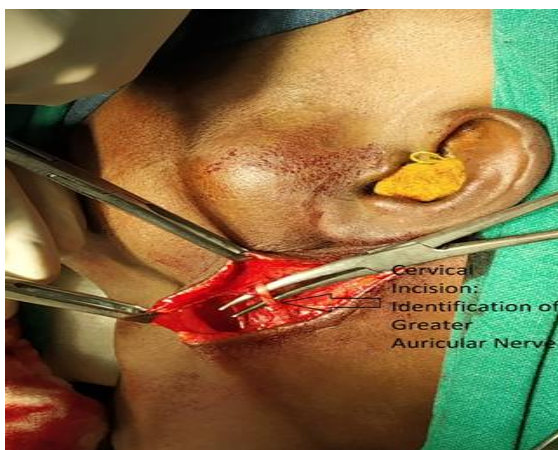
Figure 1: Initial Cervical Incision

Once the main trunk was identified, all the peripheral branches were dissected out in prograde manner (from main trunk to the pes) in standard manner. Deep lobe resection was done in standard manner if indicated. In superficial parotidectomy, our aim was to achieve a R0 resection as well as preservation of parotid duct. For total parotidectomies, FN trunk and selected branches were preserved which were not involved grossly by the tumour.