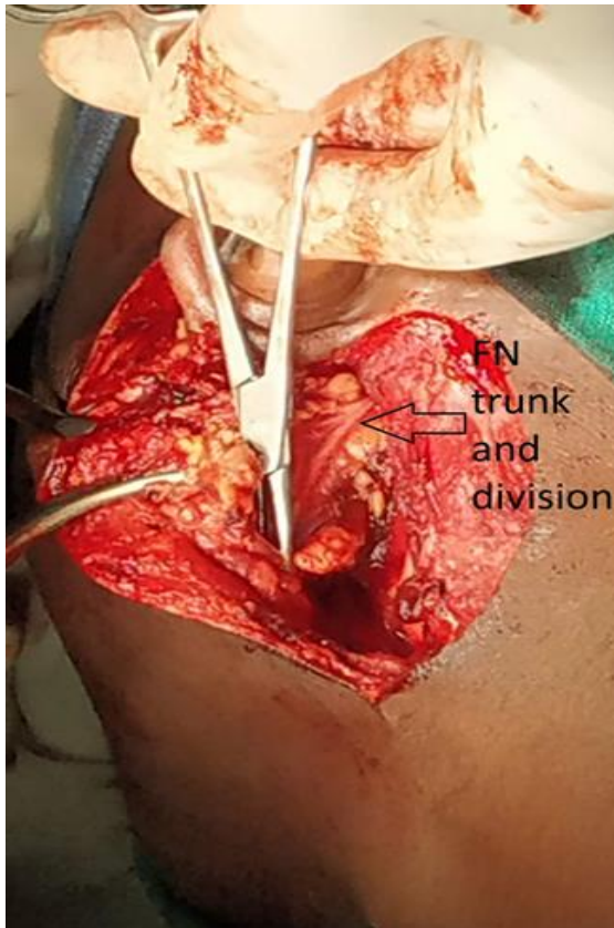
Figure 5: The Facial Nerve Lies Just Below The Forceps