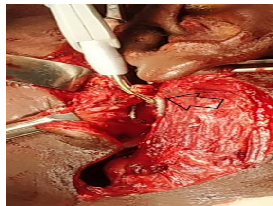
Figure 4: Tissue Above Artery Forceps Being Incised