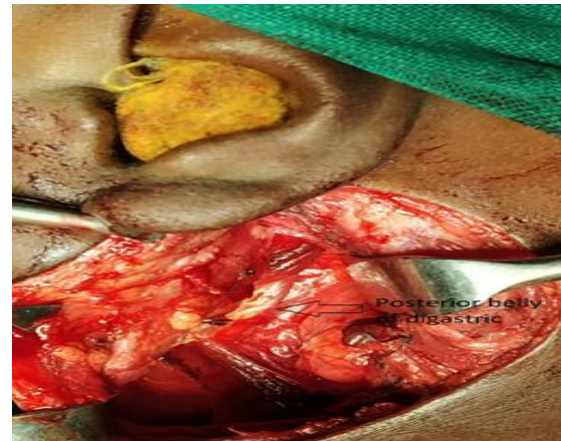
Fig. 2: Exposure Of Posterior Belly Of Digastric