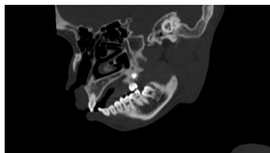
Figure 2: 3D CT scan imaging of third molar