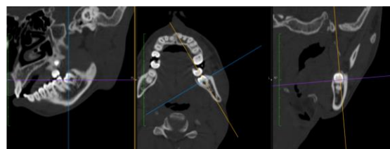
Figure 1: 3D CT scan imaging of third molar with various axes

Olze et al. validated five common classification systems for assessing the mineralization of third molars and concluded that Demirjian's stages should be used to evaluate third molars. [14] The various stages of root development of left mandibular third molars in our sample of 50 male subjects of age 18 is recorded in [Table 1]. According to Thevissen et al the estimation of dental age, particularly in young individuals, should be based on data collected from an appropriate population. [15] In our current study despite variability, there was a clear correspondence between the developmental stage. A high percentile of third molars roots in our sample population are seen to be in stages E and F of Demirjian's Classification. [Figure 4]