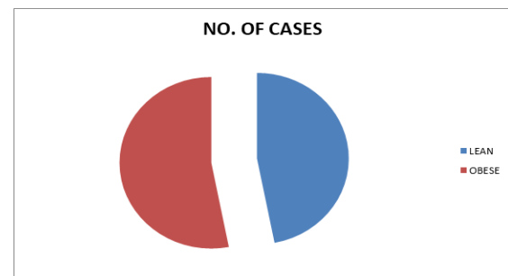
Figure 2: This Graph Showed Distribution of Cases According to Obese/Lean