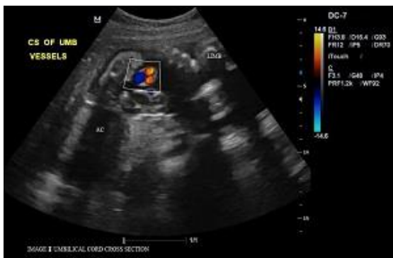
Figure 3: Umbilical Cord Cross Section with Colour Doppler.

The increase in cord cross section attends a plateau in primigravida but not in multigravida. Umbilical cord cross-section area help to predict the gestational age correctly in cases of difficulty in measuring BPD, HC, AC, FL, like anencephaly, hydrocephalus, achondroplasia, small for age fetus.