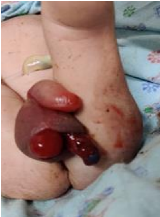
Figure 1: Showing the edematous penis, ruptured scrotum, and exposed bilateral testes with the gangrenous left testicle.

The USG scrotum was repeated and showed normal-sized right testes with normal blood flow on Doppler study. [Figure 3]