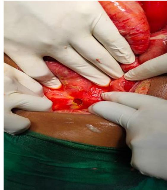
Figure 2: Gastric perforation

[Table 4] shows the causes of peritonitis in the surgical patients included in our study group and the surgical procedure done in them. All the patients had some form of Hollow viscus perforation. Duodenal perforation was the most common cause and anastomotic leakage was the least common cause.