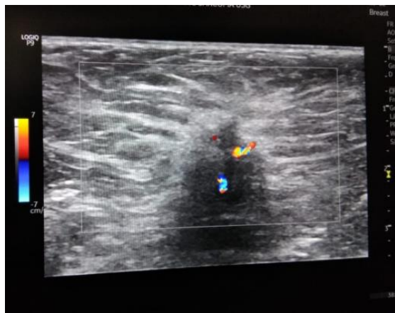
Figure 1: USG image of left breast in a 62 year old female showing hypoechoic, taller than wide mass with spiculated margin and central vascularity