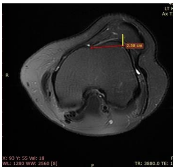
Figure 4: Increased TTTG distance of 25.8mm (axial T2FS image)