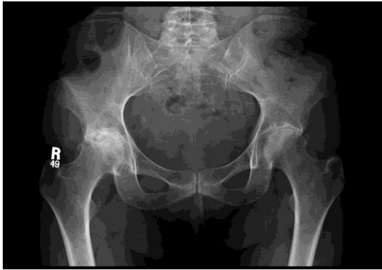
Figure 3: Plain X-ray shows joint space reduction in bilateral hip joint and sclerosis in bilateral femoral head with loss of normal contour of right femoral head