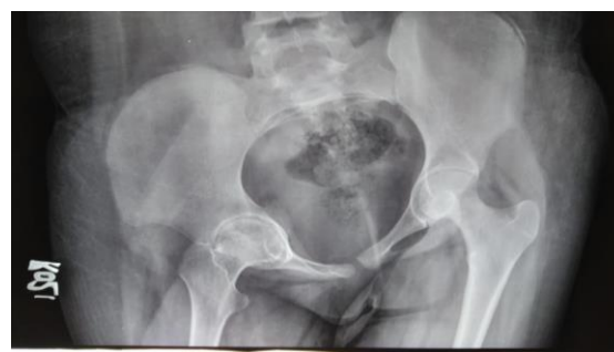
Figure 1: Plain X-Ray showing shortening of right limb (compare level of lesser trochanters) in keeping with a coxa magna deformity in this patient. Shows small epiphyseal size on right side with apparent increase in density of the epiphyses and blurring of physcal plate. Widening and flattening of femoral head and neck with thin sclerotic line running across femoral neck(Sagging Rope sign)

A female patient aged 13 year complaining of right hip pain and a limp during walking.