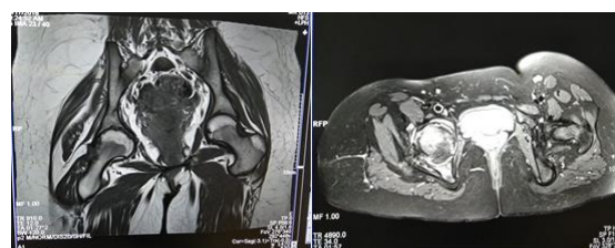
Figure 2: MRI Coronal image showing irregularity of the femoral head, asymmetrical femoral epiphysis and widening of joint space with the erosion of articular cartilage. Axial PDFS image showing hyperintensity in right femoral epiphysis suggestive of bone marrow edema

Right Osteomyelitis and Left Psoas Abscess with Bilateral AVN