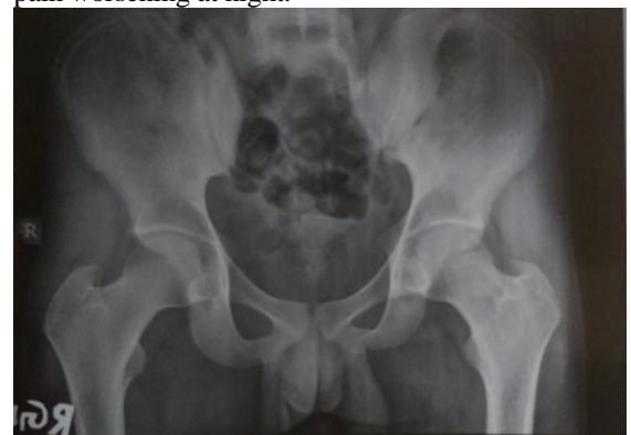
Figure 7: Plain X-ray shows well defined oval radiolucent nidus with cortical thickening in the intertrochanteric region of neck of left femur.

A 19 years old male patient complains of left hip pain worsening at night.