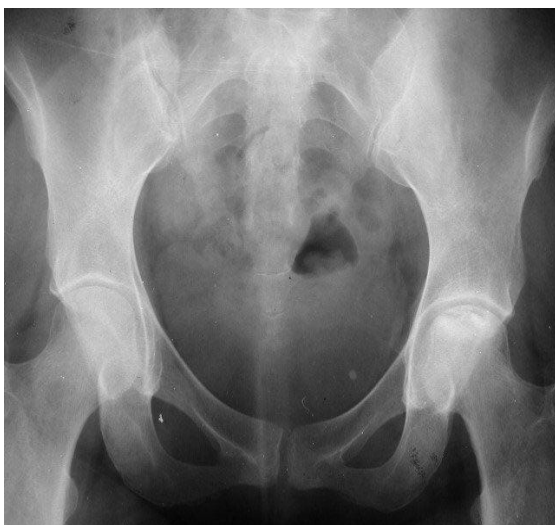
Figure 5: Plain X-Ray showing normal hip joints bilaterally with preserved joint space

An 25 years old male patient complaining of chronic hip pain with limping gait.