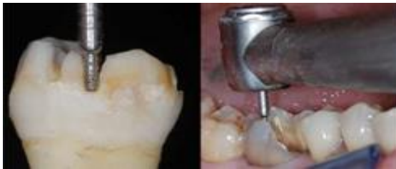
Figure 1: Making the guide grooves