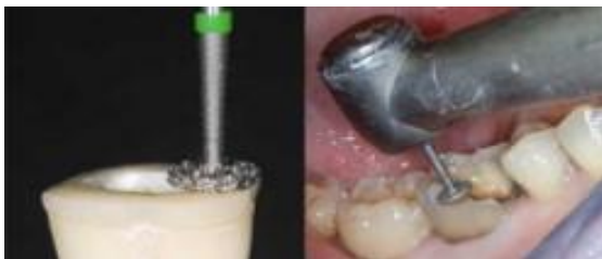
Figure 2: Preparation of the cervical margin or "cervical sidewalk" using a wheel bur held parallel to the occlusal plane.