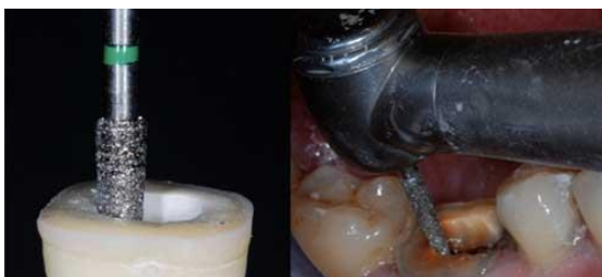
Figure 3: Axial preparation using a cylindro-conical drill to make the coronal pulp chamber continuous with the access cavity.