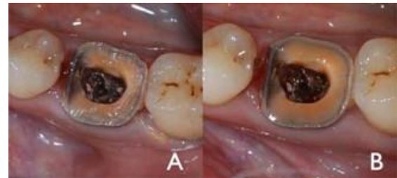
Figure 5: Cervical margin before (a) and after (b) polishing

This should be done with a nonabrasive instrument to maintain the integrity of the canals entrance. No drilling of dentin is carried out. A hot small Burnisher can be used to remove the 2mm of Gutta Percha.