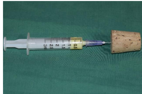
Figure 2: Sample in the syringe with widen cork