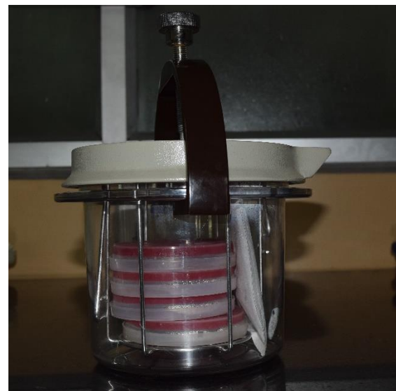
Figure 3: Anaerobic jar with plates and Gaspak