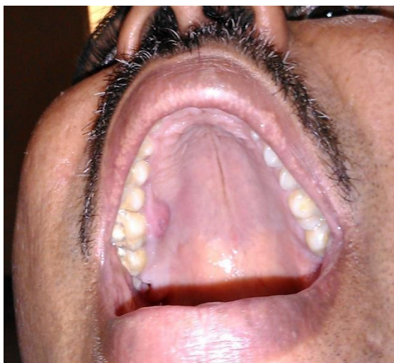
Figure 1: Dentoalveolar abscess in anterior palatal region