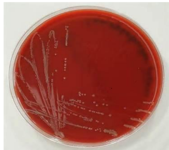
Figure 4: Growth of organisms

Peptostreptococcus spp (26.72 %) was isolated in 31 instances in which Metronidazole was the most sensitive drug (100%) followed by Amoxicillin/clavulanic acid (95%), Clindamycin (88%), Cefotaxime and Ciprofloxacin (70%) each. The most resistant drugs were amoxicillin (100%). Peptococcus (22.41 %) was isolated in 26 instances in which Metronidazole was the most