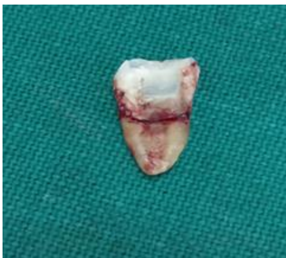
Figure 4: Extracted root