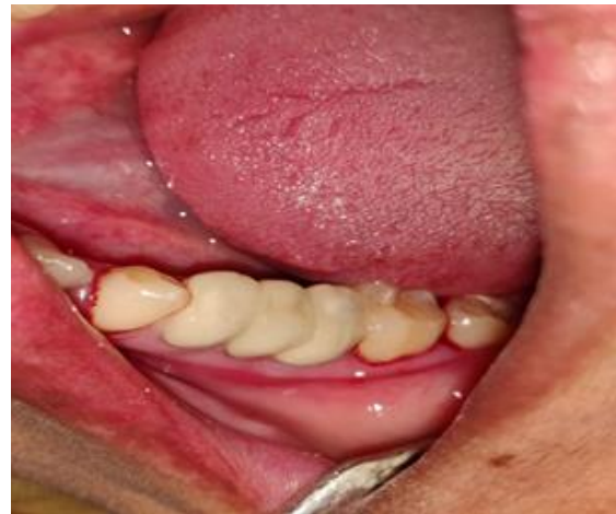
Figure 5: PFM crown placed