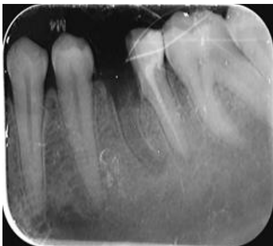
Figure 3: Hemisection done

In the present study, a total of 100 patients who underwent Hemisection of molars were analysed. On follow-up, it was observed that tooth was lost in 5 cases, while the tooth was present and was in good condition in 95 patients. Hence; the prognosis on two years follow-up was found to be 95 percent. Non-significant results were obtained while assessing age, gender and history of bruxism as a risk factor for prognosis. Jean-Marie Megarbane et al evaluated the long-term effects of root resection and hemisection of 195 patients with up to 40 years of follow-up. Records of 195 patients who had undergone root resection or hemisection were reviewed. A minimum follow-up of 5 years was needed. A molar was recorded as survival if it was still present and functional without any signs of discomfort, pain, or pathology from restorative, endodontic, and periodontal points of view. Ninety-eight patients were excluded for not accomplishing the minimum 5-year observation period. Of the 97 remaining patients, 5 teeth were lost during the first 5 years of treatment and 92 teeth survived the follow-up period, ranging from 5 to 40 years. The overall survival rate was 94.8%. [10]