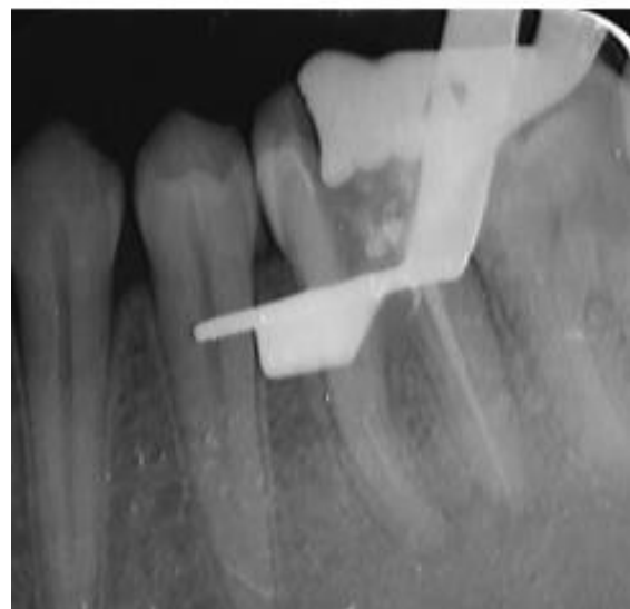
Figure 2: Obturation done

partial denture, or a dental implant to replace the missing tooth. However, with appropriate case selection, hemisection can be a relatively simple, conservative, inexpensive treatment with good chances of success. Hemisection and root resection have now been established as successful treatment modalities. [7-9] Hence; the present study was conducted for assessing the profile of 100 patients of tooth Hemisection and their outcome upto 2 years of follow-up.