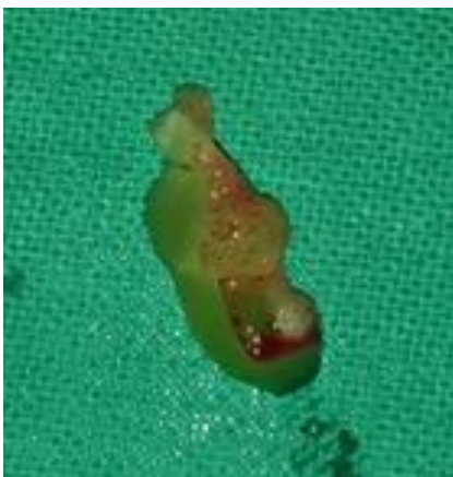
Figure 2: PRF gel ready to place in extraction socket

A total of 100 g of turmeric block was acquired and ground using mortar and pestle and a paste was prepared with distilled water which was then introduced into the extraction socket.