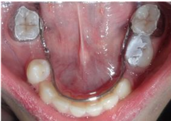
Figure 6: LLHA in lower teeth