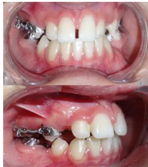
Figure 4: Banding and coil springs placed on 14 and 16

Observation of midline diastema[2mm] without any management till permanent canines erupted was done.