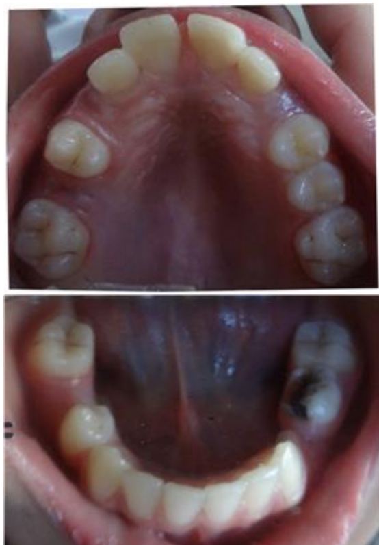
Figure 1a & 1b: Pre-operative photographs of upper and lower arch.

and a mobile tooth. Past medical history was insignificant. Past dental history had shown that the patient got her decayed deciduous teeth extracted in private set up due to caries few years back. There was End on molar relationship bilaterally. Non erupted teeth were upper canines, upper right second premolar, lower right second premolar, left lower first premolar. [Figure 1a & 1b] The patient's chief complaint was attended and at the same time, her parents were informed about the space loss and its sequelae and the importance of timely intervention for the preservation of loss of arch length.