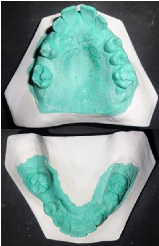
Figure 2a & 2b: Pre-operative models of upper and lower arch

Later, Models were made to check the space discrepancy. [Figure 2a & 2b]