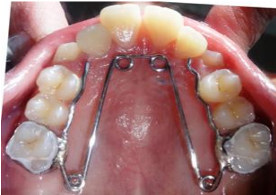
Figure 7: Quad helix placed after eruption of 15