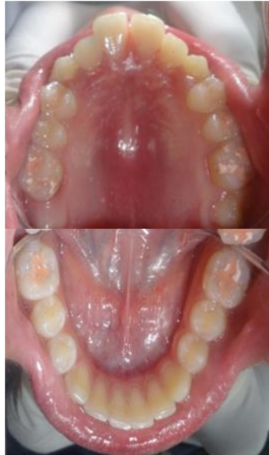
Figure 9: Upper and lower arches after full treatment