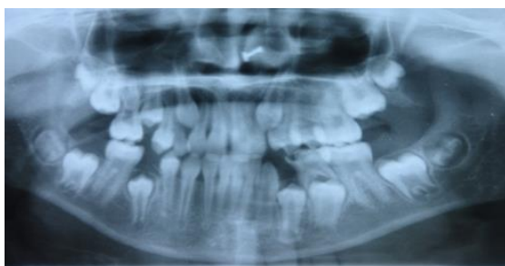
Figure 3: Pre-operative OPG showed loss of space wrt 15 and adequate space for lower molars.

The following measurements were made from the models [Figure 2a,b]