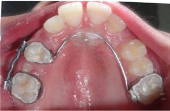
Figure 5: 14 supported with nance holding arch