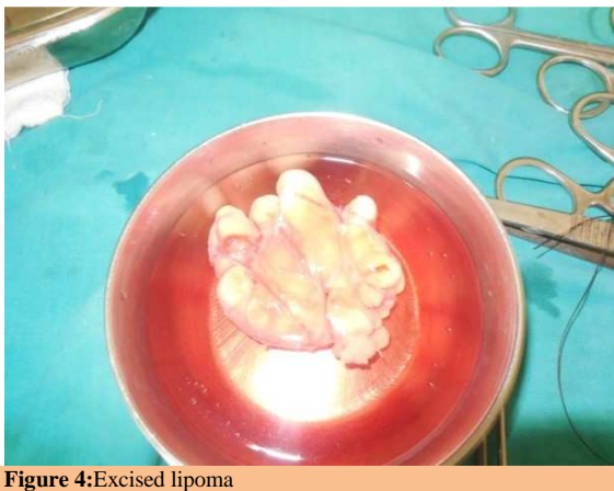
Figure 4: Excised lipoma

Takayashu et al. believed that perineal lipomas resulted from pluripotential anlage of labio-scrotal swelling from a teratoid structure. [6] Thorough investigation in the form of local ultrasound, FNAC, and if indicated MRI of the pelvis is required to