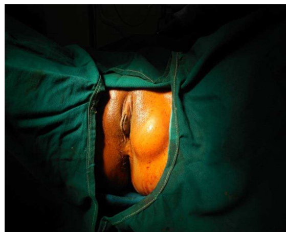
Figure 1: Swelling in perineal region

Perineal lipoma is a very rare site of lipoma to occur which leads to difficulty insitting for the patient and may interfere with defecation. Inter-sphincteric extension or obstruction by the swelling may occur if it is close to anal sphincter. If it is in close a proximity to vagina may lead to dyspareunia or hematocolpos. [4,5]