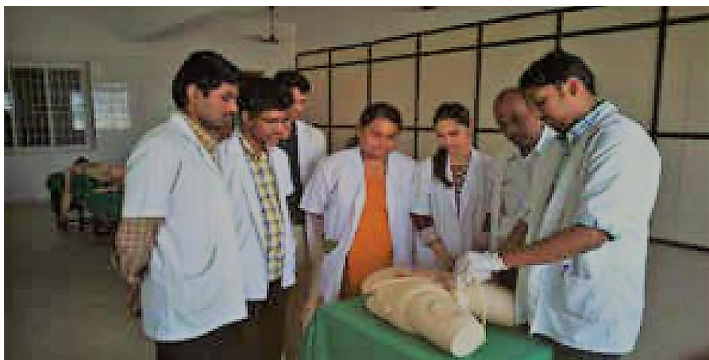
Figure 1: Interns performing the urethral catheterization on a mannequin in small groups (Pre-test)

The mean scores of the pre-test were 3.3 and the mean scores of the post-test were 9.2. The over all mean scores show a highly significant improvement in post-test scores (Table 1). Although both male and female interns showed significantly improved post-test scores, analyzing the collected data further revealed that the female interns showed more significant improvement in the post-test scores comparatively. (Figure 2)