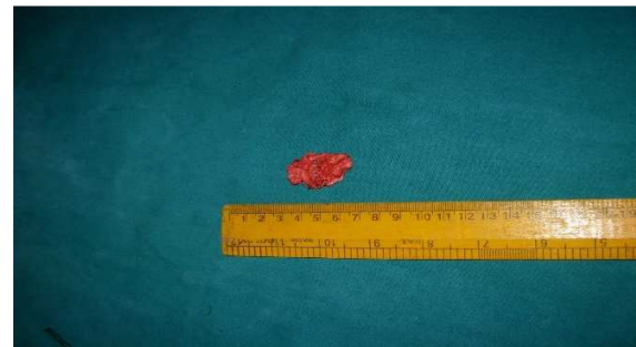
Figure 2: Excised disc material

post-operative complications and ultimately shorter convalescence period would be the ideal one. Discectomy by inter-laminar fenestration technique is exactly that kind of a surgical procedure where only the inter-laminar space is utilized without removal of any significant part of the lamina, the cord is exposed, retracted and the discectomy carried out.