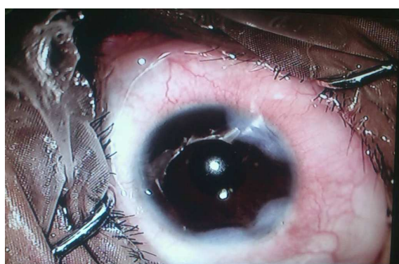
Figure 4: Same case after aspheric IOL Implantation & sealing of two wounds.

Although, an astigmatic axis shift is affected by the size, location, and shape of the incision, it was reported that the incision size has a major impact on SIA. [15] The appropriate size for a self-sealing corneal incision is 2.8-3.5 mm, [16] and the allowable limit of the keratometric shift for refraction and visual rehabilitation is approximately 0.50 D. [12,13] This can be achieved with a 2.8 mm incision. With the introduction of micro-incisions (2.2 mm or less), it is now possible to minimize the SIA compared to larger