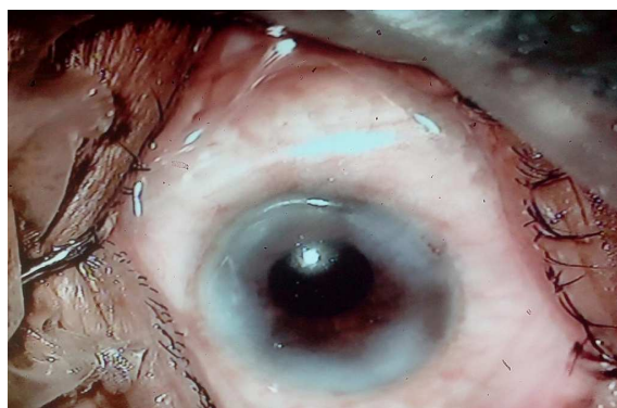
Figure 2: Same case after aspheric IOL Implantation & sealing of three Wounds