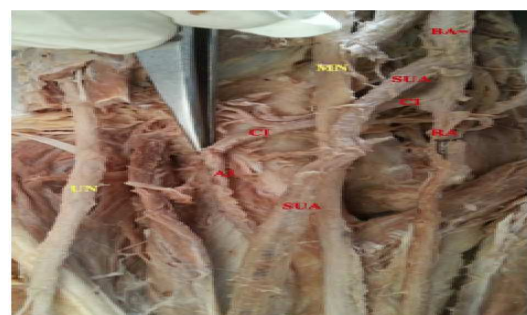
Figure 1: Origin of SUA [superficial ulnar artery] from BA [brachial artery].

Ulnar artery originated from brachial in distal part of the arm. it descended on the lateral side up to the cubital fossa and crossed from the lateral to medial side superficial to Median nerve [Figure 1] to run on medial aspect of forearm accompanying the ulnar nerve in lower 1/3 rd part of forearm. [Figure 2].