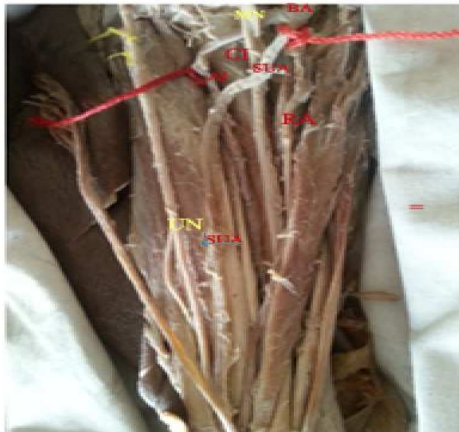
Figure 2: UN accompanying SUA in lower part of forearm.

In the lower part of the forearm ulnar artery lies superficially in b/w Flexor Carpi Ulnaris and Flexor digitorum superficialis, at the wrist it coursed superficial to flexor retinaculum to enter the palm along with the ulnar nerve. Throughout its course it was superficial and gave no branch