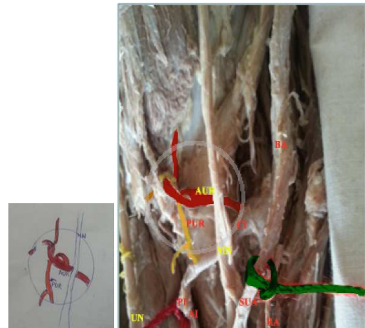
Figure 3: AUR [Anterior ulnar recurrent winding around PUR [Posterior ulnar recurrent] from below upwards. [As seen in inset].