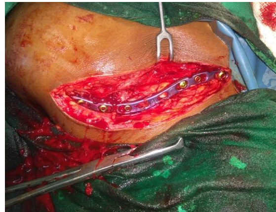
Immediate Post-Operative Photo

to union was 6.8 months. No patient developed non-union or mal union. Two cases developed superficial infection (p = 0.62) but infection was controlled by oral antibiotics in all the cases. There was no deep infection. No implant failure occurred. Hypertrophic scar formation was observed in two cases. Two patients had symptomatic hardware prominence. Only one patient had early mechanical failure who underwent revision.